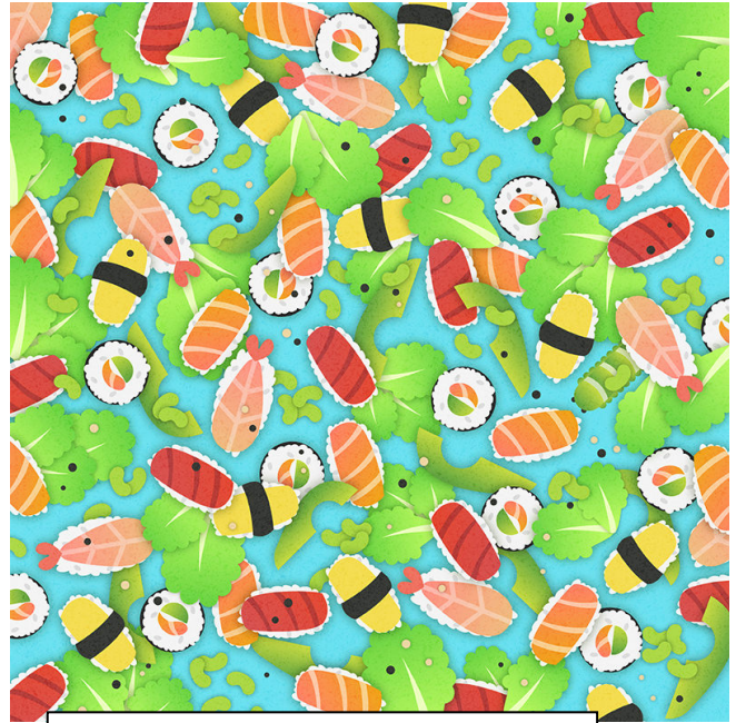
Find the caterpillar within the sushi