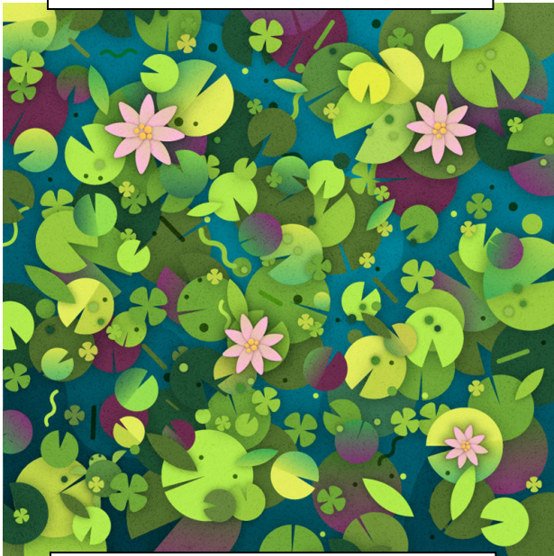
Find the turtle in the lily pads