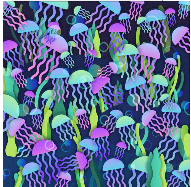
Find the mushrooms in the jellyfish