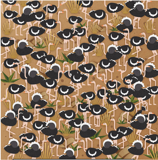
Find the umbrella within the ostriches